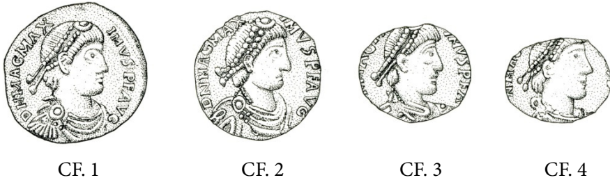
Fig. 7 – Guest 2005, p. 111

should not likewise be considered to have been 'clipped'. In fact, the low weight and unclear legends of these two coins, as well as that of the other two siliquae found in Hispania, clearly indicate that all four were cut in ancient times, shortly after they were minted. In contrast, in the siliquae found in Spain, the mint-mark PSNB is certainly more visible and better conserved than in the two found north of the Pyrenees [14] , though perhaps this feature is simply attributable to their reverse flan having received the imprint of a die which had been moved upward slightly. Even so, and despite these small differences which result from the minting process, it may be seen that none of the four Priscus Attalus siliquae have legends which are fully visible on both obverse and reverse. It is clear that in all cases there is, to use the terminology of P. Guest, a moderate 'clipped factor' on all four coins (CF.) of around 2 or 3, with 1 as the minimum and 4 the maximum (Fig. 7) [15] .